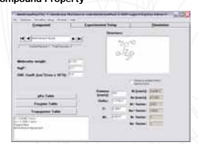
Figure 2. MembranePlus compound tab. The program allows two ways of accounting for passive diffusion through cell membranes: (1) S+ model as listed in Eqn. 1 and 2; and (2) direct transport parameter entries for all neutral and charged species.