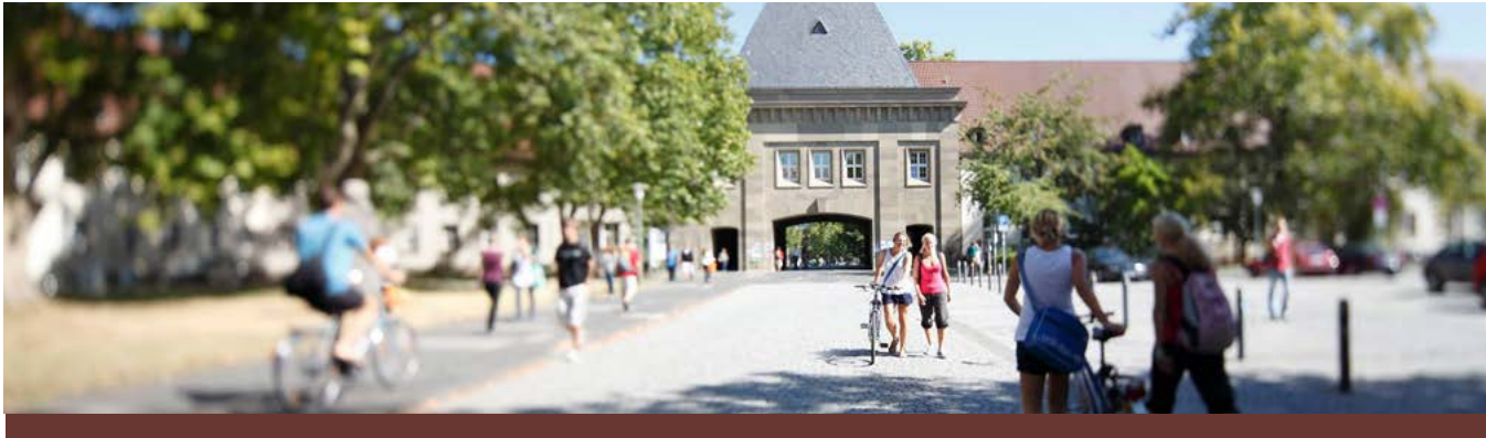
Attendance for this event is limited, so register today!

This three-day, hands-on course provides a working knowledge of the basic theories and application of state-of-the-art PBPK simulation and modeling software for the analysis of drug dissolution and absorption, coupled with the resulting pharmacokinetics and pharmacodynamics. A combination of presentations and interactive examples, taken from actual industry experience and using GastroPlus, illustrate how to recognize and deal with the multiple interacting phenomena that affect the absorption, PBPK/PD and DDIs of particular drugs and dosage forms.