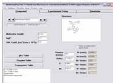
Figure 2. MembranePlus compound tab. The program allows two ways of accounting for passive diffusion through cell membranes: (1) S+ model as listed in Eqn. 1 and 2; and (2) direct transport parameter entries for all neutral and charged species.

The membrane entrance and exit rates are given by Eqn. 1 and 2, as modified from [2] and [3]