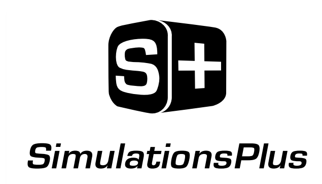
Stacked Logo Black