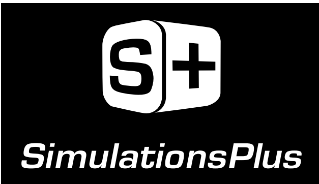
Stacked Logo White