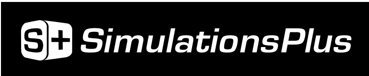
Primary Logo White

Some instances will require a one color logo. For example, when using a logo against a background that doesn't provide enough contrast between logo and photo OR when printing in black and white.